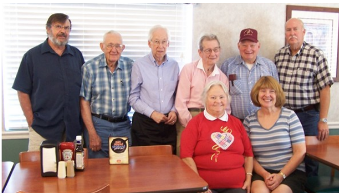
left: Golden Eagles