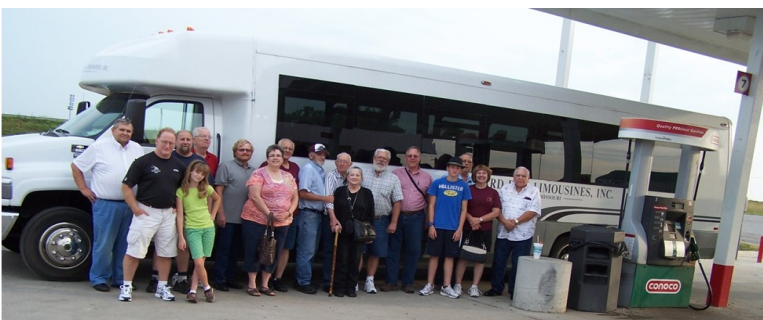
bus trip to St. Charles