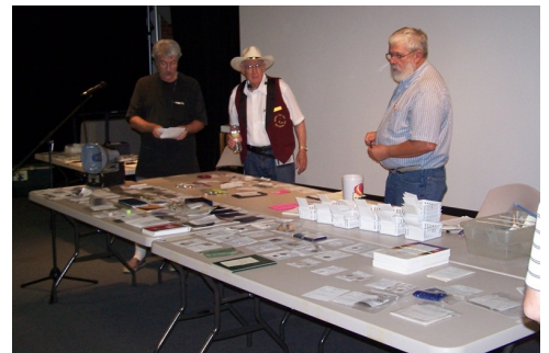
tables set for "Special" Joplin Auction