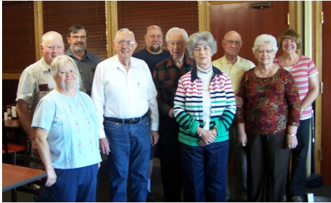
left: Golden Eagles

PLEASE NOTE: NEW LOCATION: 2020 E. Primrose