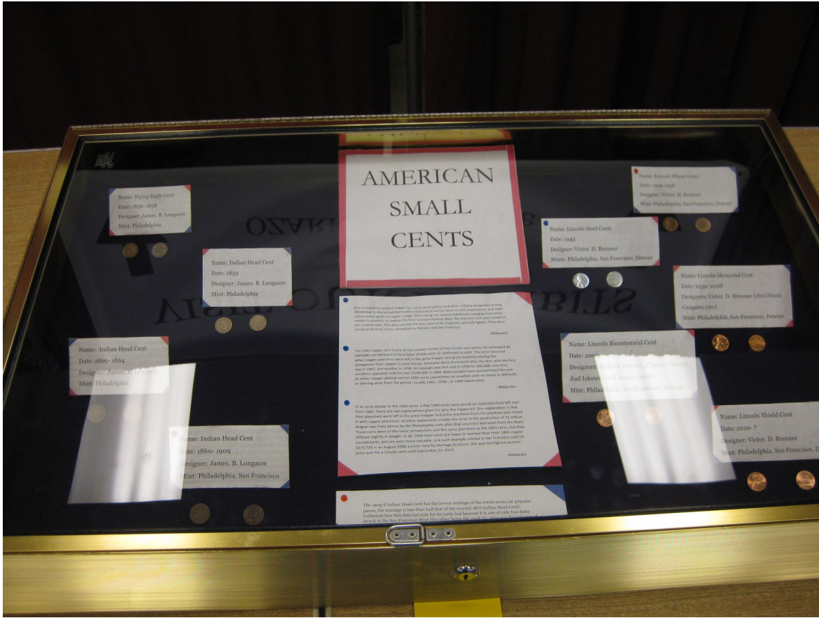
1st Place Exhibit on American Small Cents