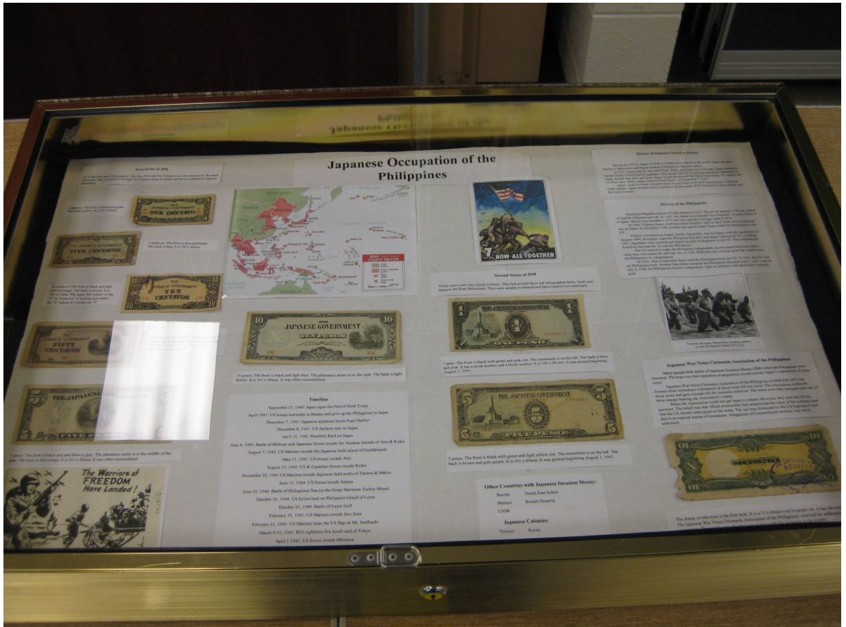
2nd Place Exhibit On JIM